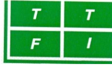
TABLE TENNIS FEDERATION OF INDIA